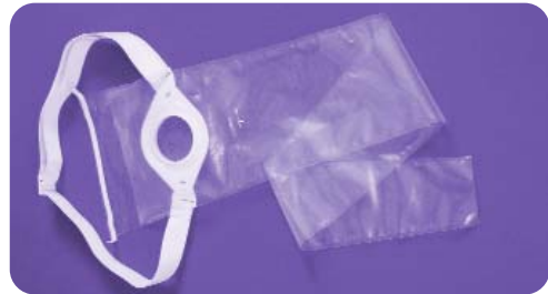
Irrigation belt flange and sleeve

The water container should be clear, enabling the water level to be seen, and should desirably have a liquid crystal temperature indicator. The flow control should be easy to operate with one hand. The irrigation flange should give a secure seal around the stoma and the sleeve should be long enough to hang into the toilet. It can be trimmed if needed. Once used, the flange and cone should be washed with warm soapy water, dried and stored until their next use. There is normally no need to wash the reservoir.