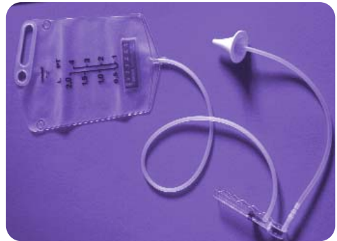
Water reservoir, tubing, flow control and cone